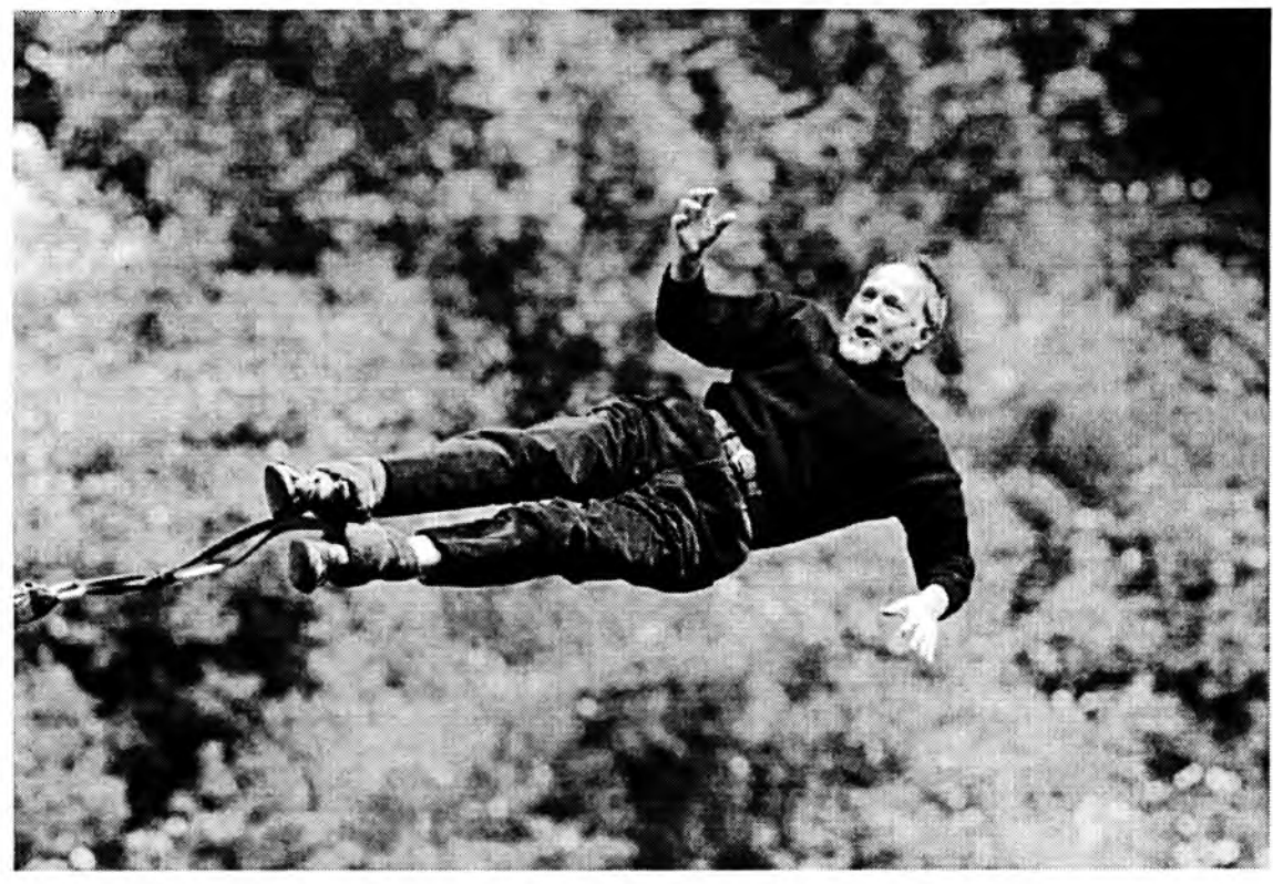
Yes, he does have his eyes open!